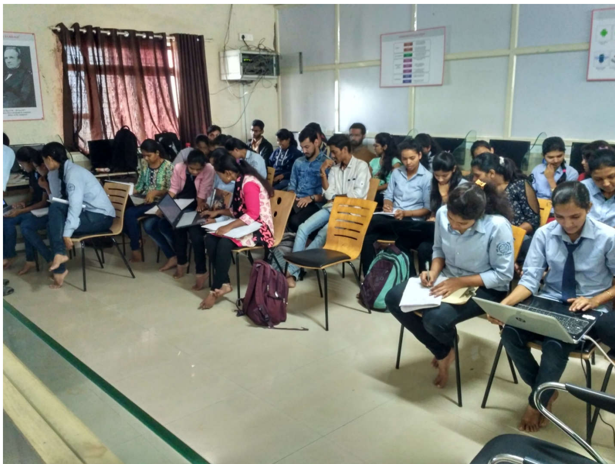
Participants Attending Workshop